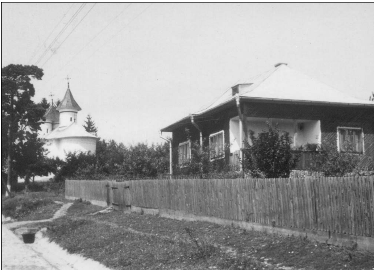
Fig. 6 - The Bukovina-German Settlement of Illischestie, showing the Rumanische Kirche.

140 . Hans Prelitsch, 'Homo bucoviniensis', in Bukowina: Heimat von Gestern , p. 337.