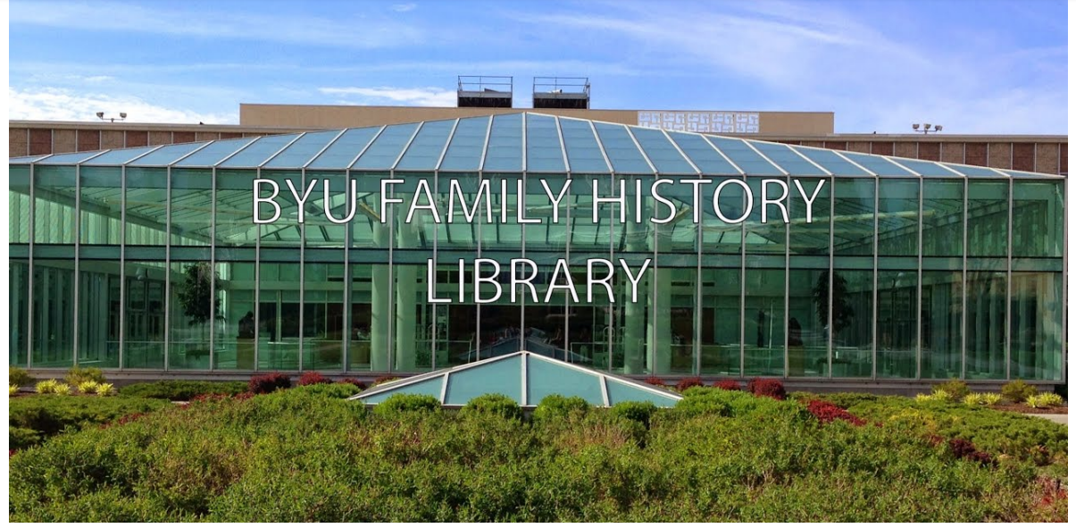
The BYU Family History Library has produced a several free webinars on Germanic and Slavic research: