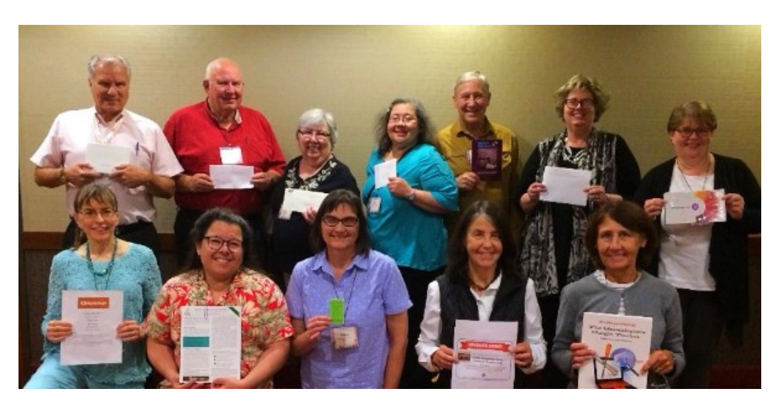
Door prize winners at the 2007 Conference Friday evening banquet.

One of the highlights of the annual conferences is the banquet, featuring a keynote speaker and great door prizes from sponsors and other donors. Luncheons, opening receptions, tours, cultural events, and appointments with consultants have also been a part of FEEFHS conferences over the years.